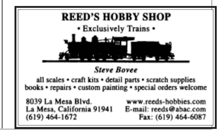
January'03 - Page 2