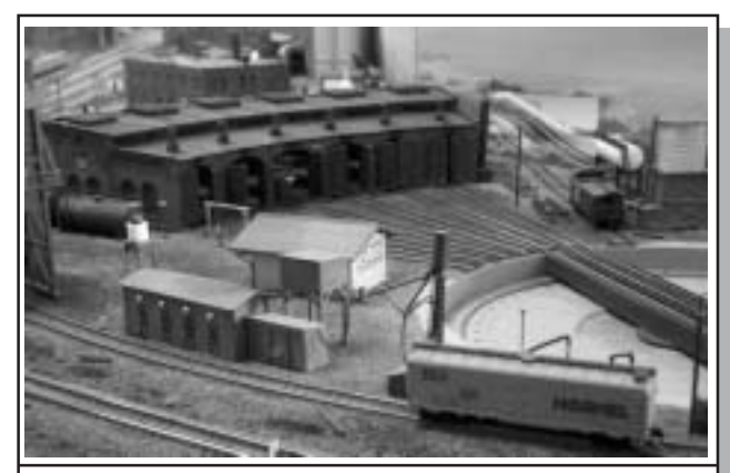
Interesting Views Along the Main Line!

Overall, I think this new format is quiet exciting! I'm looking forward to seeing layouts that I wouldn't normally get to see - including those that aren't ready for the "big time" of formal layout tours. In fact, that is part of the purpose of these events - to encourage division members to open their layouts to others regardless of the stage of completion. I don't know about you, but I'm really interested in how others solved those pesky problems that I'm hitting on my layout, or even learning what <u>not</u> to do. And I've noticed that when you get a bunch