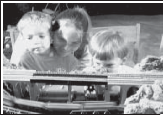
Appreciative Fans of the BSA Exhibit

http://www.geocities.com/stnsinr/Ntrak3b.html . Be sure to right-click on images and choose "view image" to see enlarged versions of each photo.