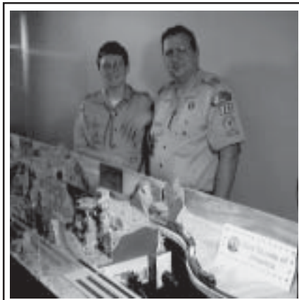
Scout and Scoutmaster