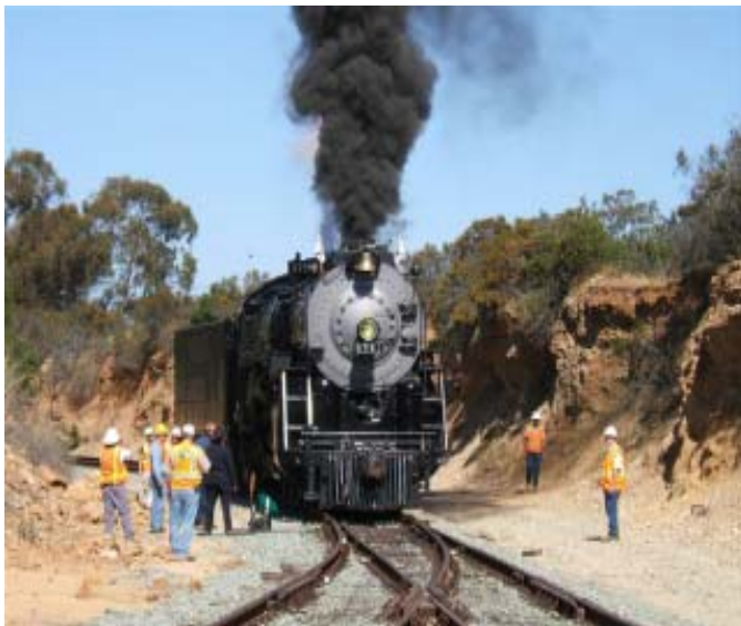
#3751 at Miramar wye

On June 1 st , ATSF's #3751 steamed into San Diego County and our community turned out in large numbers to welcome her. The North County Transit District was very accommodating for all who wanted to take photos. I caught the train heading southbound at Trestles Beach, Carlsbad's Poinsettia Station, and at Del Mar passing the Fairgrounds. Then she reversed direction on the Miramar Wye and one last time just north of San Onofre on her way back to Los Angeles. I'm not a big steam fan but I have to admit that this was a great event to see.