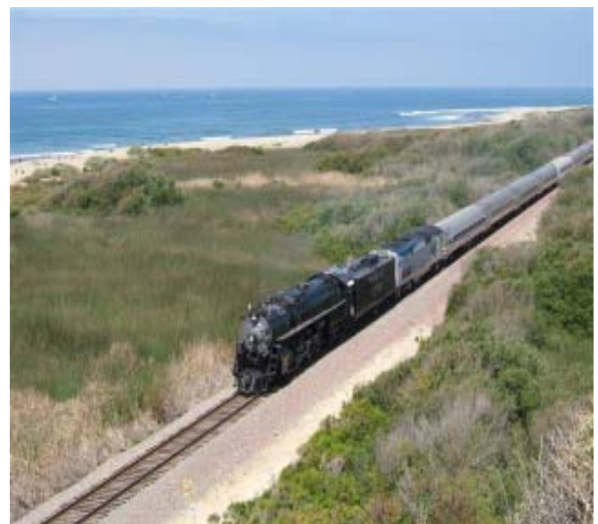
#3751 at Trestles Beach