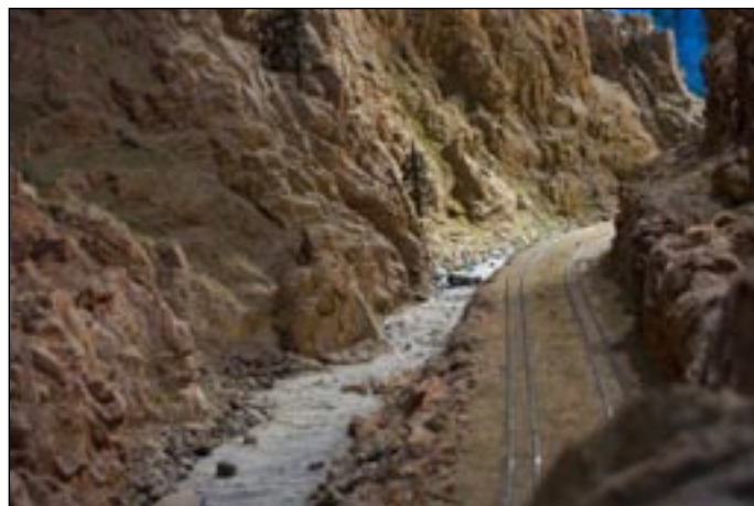
Yes - It's a Model - Pasadena 'S' Gauge Club

All layout tours are from noon to 300 PM and directions will be sent to you by postcard one week prior to the tour. The tour to Brawley in November is a long drive and if you are interested in sharing the cost of a rented van let me know and I will arrange it. Get busy on your layouts and I want to get a call from you letting me know you want to host a tour in 2006. That means you, BS, PS, DD, JB, and ???