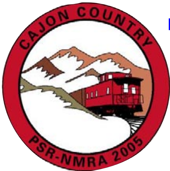
YMR Display - PSX2004