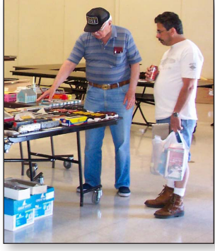
Making a sale!