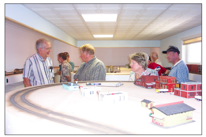
Styron - 2003

pm. Directions for all the tours will be sent to you by postcard the week of the tour. If you don't get a postcard call me at (760) 436-6139 and I will get