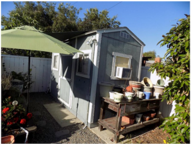
Located in a backyard 6x12' shed, this N scale layout shows what can be accomplished in a small space