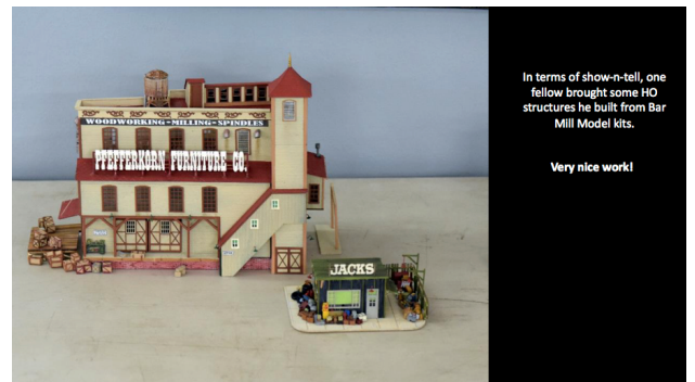
In terms of show-n-tell, one fellow brought some HO structures he built from Bar Mill Model kits.