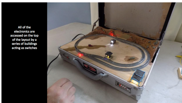
All of the electronics are accessed on the top of the layout by a series of buildings acting as switches