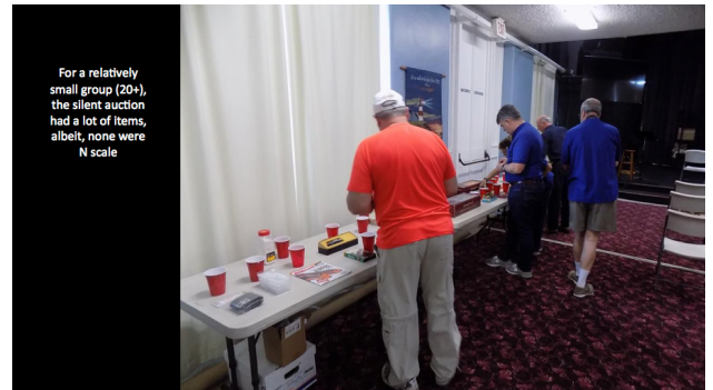
For a relatively small group (20+), the silent auction had a lot of items, albeit, none were N scale