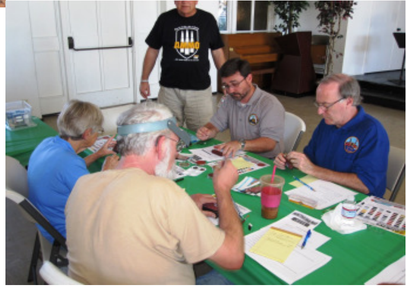
Continued on Page 9