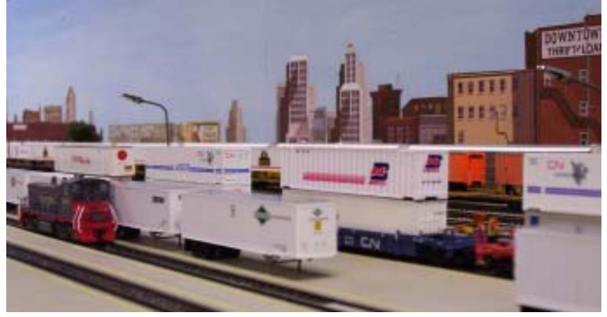
Don Fowler's N scale layout

and sharing our mutual interests in model railroading. I am constantly amazed at the talent and skills that our members possess. I am also very grateful to have an understanding and supportive wife who not only enjoys the hobby with me, but actively participates in Division activities as well.