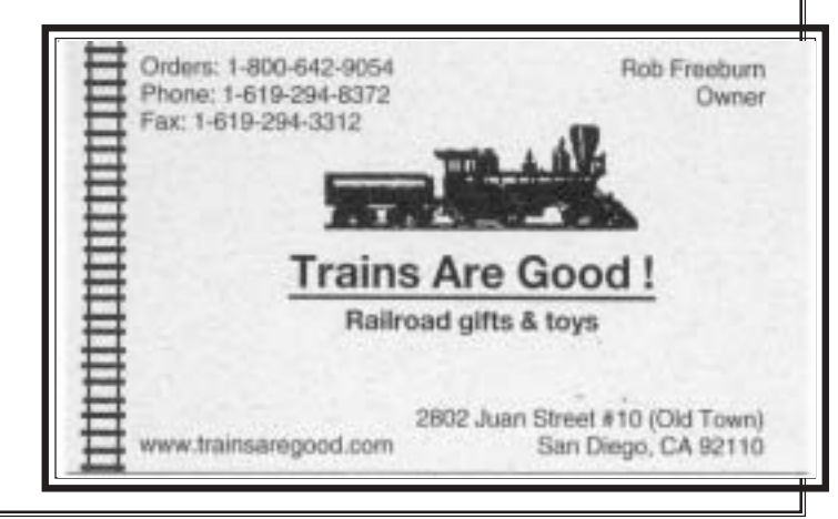
October '02 - Page 4