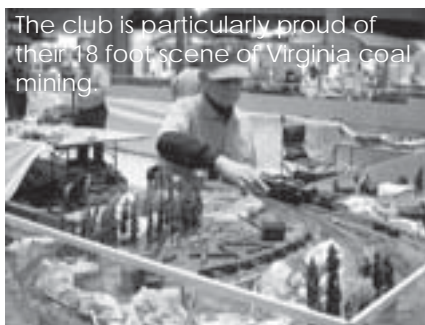
The club is particularly proud of their 18 foot scene of Virginia coal mining.

Train Song Festival in October. Our NMRA Spring Meet will be hosted by the Poway Station clubs on May 18 (see details on insert).