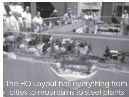
The HO Layout has everything from cities to mountains to steel plants

There is also an N scale club and modular layout that, along with the HO club, participates in Poway Station events like the