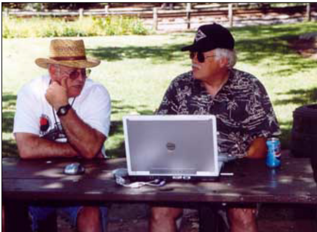
Looks like serious business!