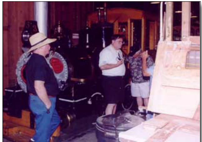
Hmmm, at 1:160 I would need...