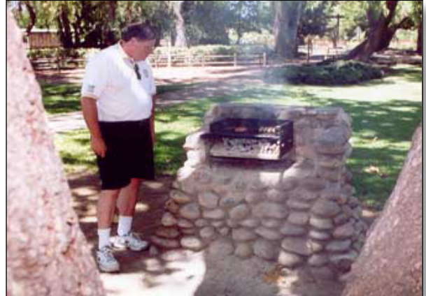
Let's see - dogs or hamburger...