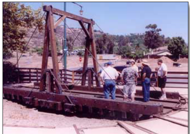
If it will hold the engine, it should hold us...