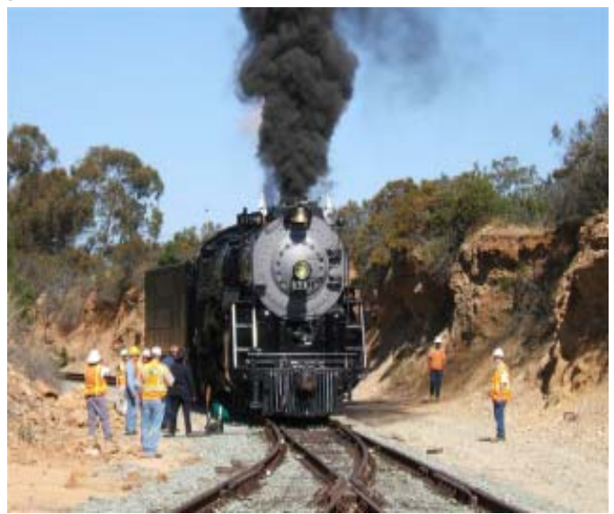
#3751 at Miramar wye

On June 1st, ATSF's #3751 steamed into San Diego County and our community turned out in large numbers to welcome her. The North County Transit District was very accommodating for all who wanted to take photos. I caught the train heading southbound at Trestles Beach, Carlsbad's Poinsettia Station, and at Del Mar passing the Fairgrounds. Then she reversed direction on the Miramar Wye and one last time just north of San Onofre on her way back to Los Angeles. I'm not a big steam fan but I have to admit that this was a great event to see.