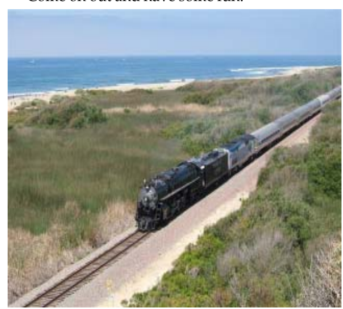
#3751 at Trestles Beach