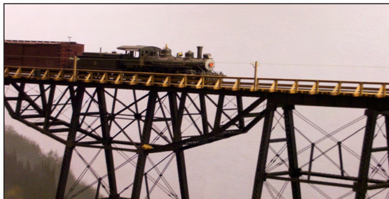
Dick Roberts - The Bridge Is In!

of Justin Rasas, who is busy building a layout that is best described as a mountain railroad with sightings of Denver & Rio Grande Western and Southern Pacific trains mixed in with a standard gauge shay or two moving loads of ore or lumber. The single track mainline is plagued with severe