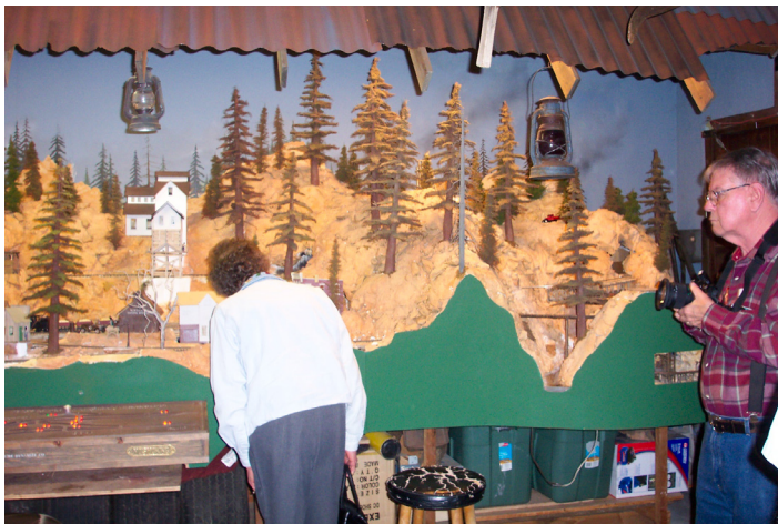
Ross Black's "Beaver Creek Railway" - On30

ago and has a double track main line with at-grade crossings requiring careful attention during operation. The smaller layout is a modification of