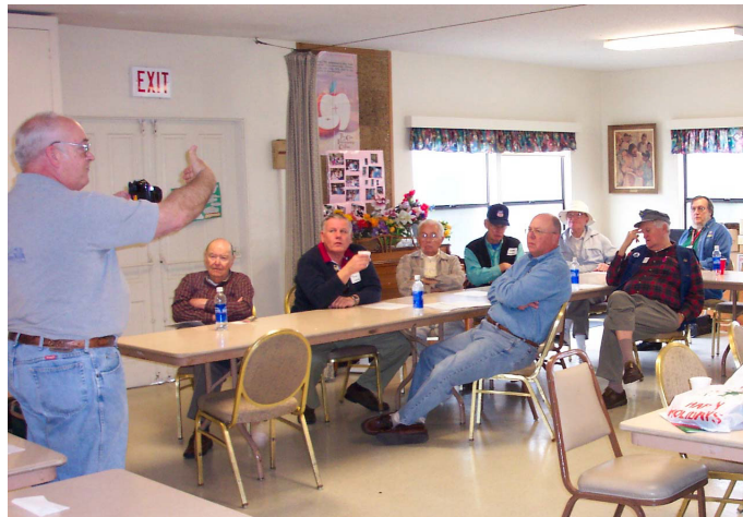
A Rapt Audience - Winter Meet 2005